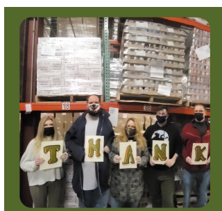
Page 7: Giving