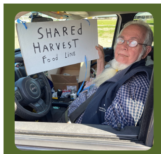
Page 6: Faces of Hunger & Advocacy Corner