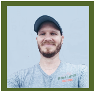
Page 2: Letter from Director