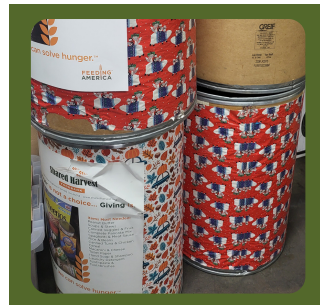
Page 3: Holiday Food Drives