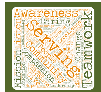
Page 8: Our Team & Values