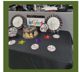
Page 4-5: Darrell