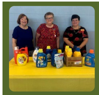
Page 7: Giving