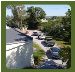
Page 6: Faces of Hunger & Advocacy Corner