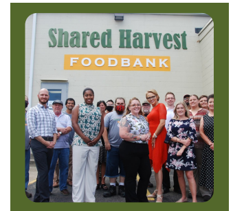
Page 4-5: Choosing to End Hunger One Meal at a Time