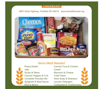
Page 8: Holiday Food Drives