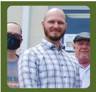
Page 2: Letter from Director