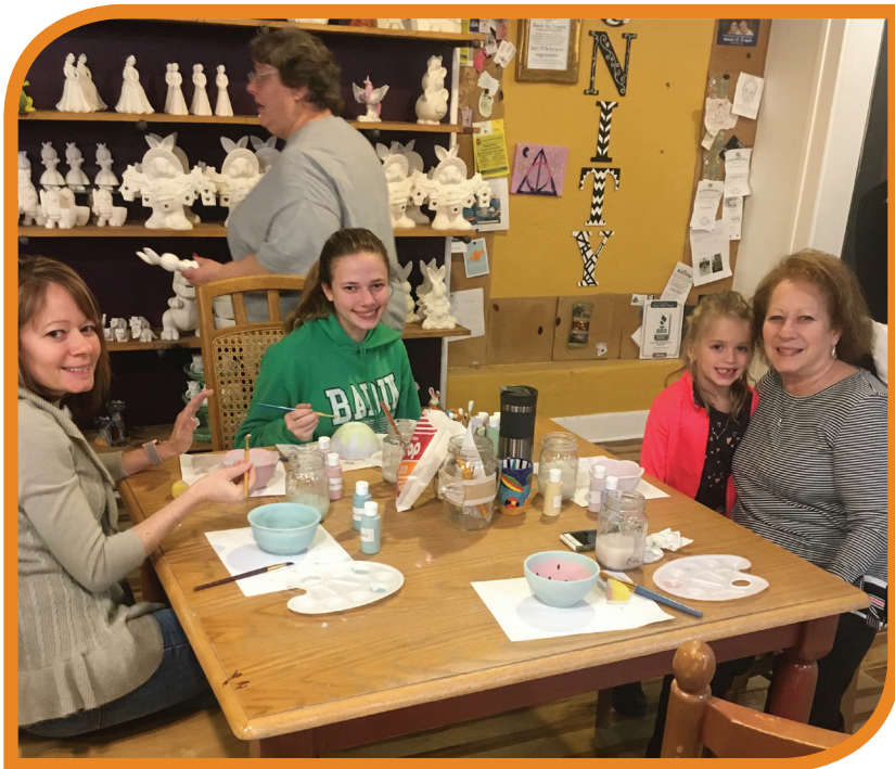
The Front Street Presbyterian Church in Hamilton celebrated Ash Wednesday with a soup dinner and a bowl painting party. Participants were able to purchase a bowl for $10 to benefit Shared Harvest Foodbank.

Chickpea Chicks Hummus Cowan Systems Fresh Sausage Specialists Frito-Lay Company Meijer Distribution Center Mondelez/Nabisco Ohio Association of Foodbanks Ohio Dept. of Job & Family Services Snyder Lance Tri State Ingredients USDA Westrock/McCormick